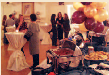
Highland Park Cocktail Reception