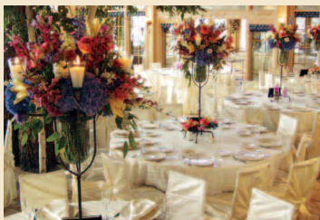
Marcello's Italian Courtyard